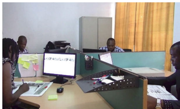
Identifying incidents and colour-coding articles (4.2.i.)

Once all incidents have been identified and colour-coded within the papers, the Assistant Coordinator verifies them against existing entries in the database. This step is crucial to avoid duplication of the data and ensure its accuracy. Journalists may report or refer to an event which has already been reported on in the past and therefore already been recorded. It is important to identify the existing data entry in order to check the number of deaths reported in the past against the number reported in the new article. If the number is the same then the Assistant Coordinator flags the article so that no one enters the incident again in the database. If the number differs then he updates the entry to reflect the new information. The update can be of two sorts: a new source reported a number which differs from the one entered at the first time of recording, in which case the new number is added to the list of numbers reported by source; or the same source may be publishing a new count from one it reported in a previous article, in which case it is assumed that the later information is the more accurate and must supersede the earlier.