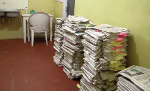
Three months worth of archive of Nigeria Watch sources

others. The convening of the CRN and the creation of a set of standards for the field aims to ameliorate such challenges for future casualty recording “start-ups”, who will be able to benefit both from the advice of their peers and a more thoroughly tested set of methods and standards.