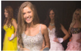
Snapshots at "Miss Club" beauty contest in Belarus