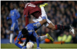
Chelsea reaches last 16 of UEFA Europa League