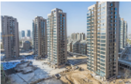
Housing prices rise accelerates in major Chinese cities