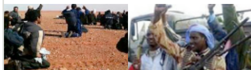
Death toll in Algeria rises to 81