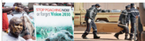
Kenyans protest against poaching of elephants and rhinos