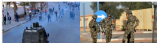
Police, protesters clash in Alexandria, Egypt