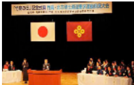
Japan's Shimane holds event over disputed islands