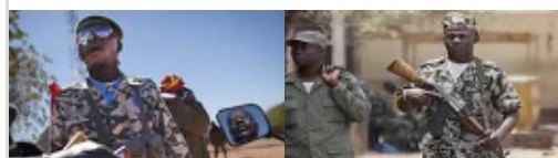
Malian forces patrol Diabaly