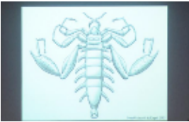
Chinese scientists identify prehistoric species