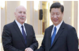
Chinese leader calls for further development of SCO