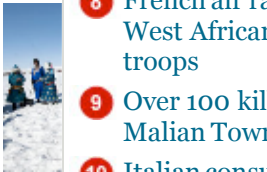
Lives festival in Mongolia