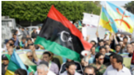
Situation in Libya