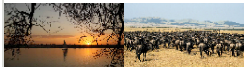
Sunset view in Cairo