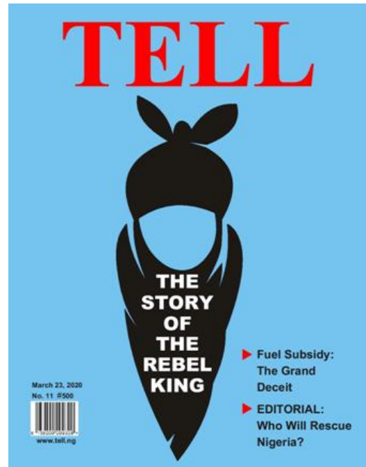
The Story Of The Rebel King ₦300.00