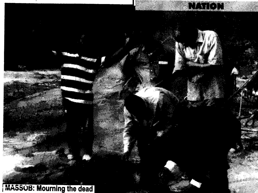
MASSOB: Mourning the dead

cluding the one in question) that included an attempted murder, arson, illegal possession of fire arms, stealing and torture. The I.G.'s directive was based on a series of criminal complaints by the Anambra CLO.