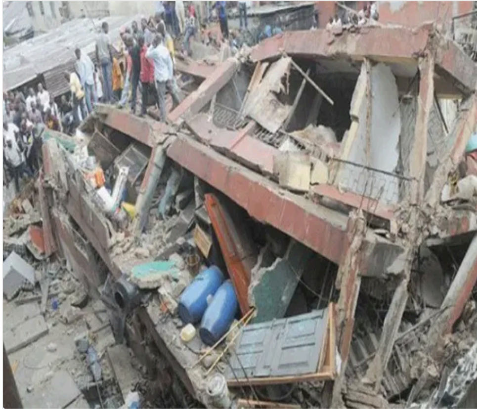
File image for illustration.