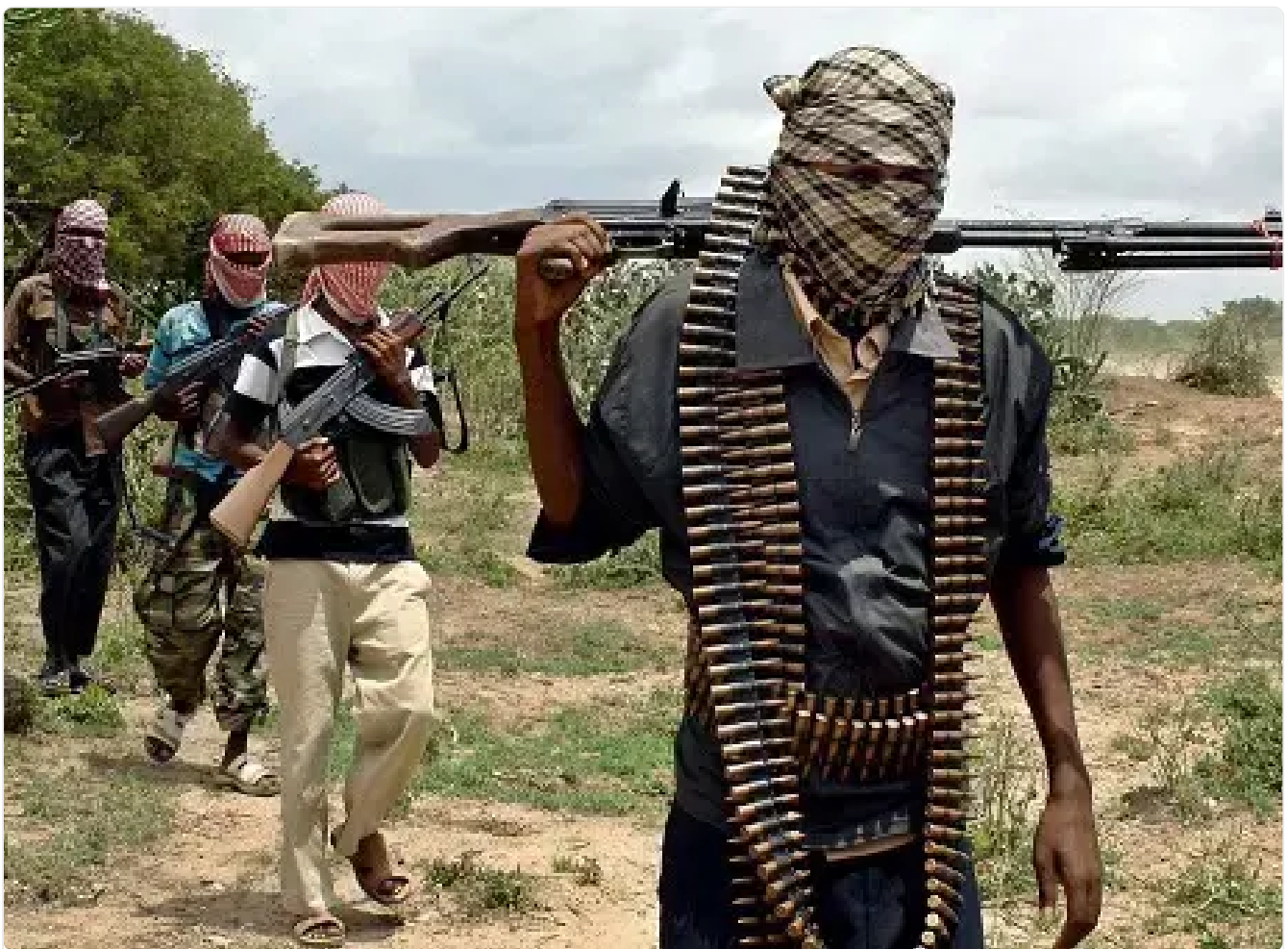
File image of bandits