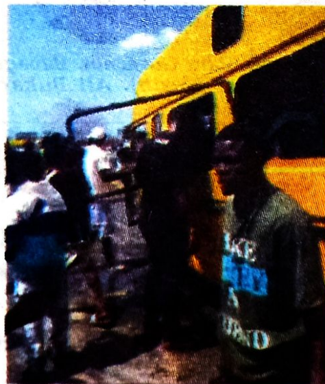
The ill-fated bus.