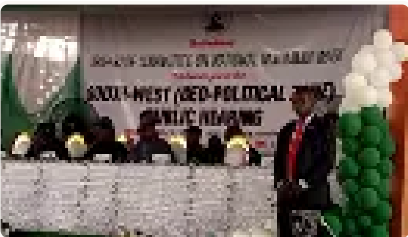
Minimum wage: Lagos workers demand N794,000 as living wage