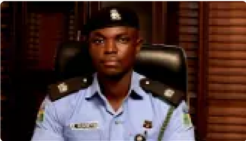
Warehouse looting: Police, NEMA on red alert against hoodlums in Lagos