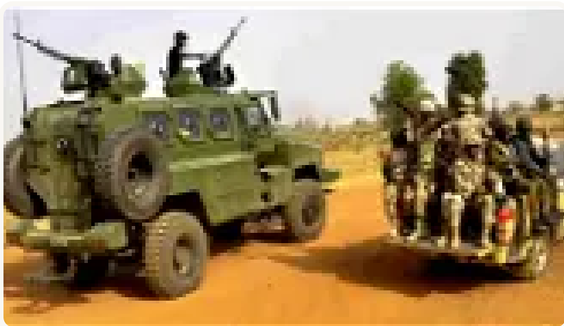
Troops foil attack on Sokoto community, neutralise two terrorists – Army