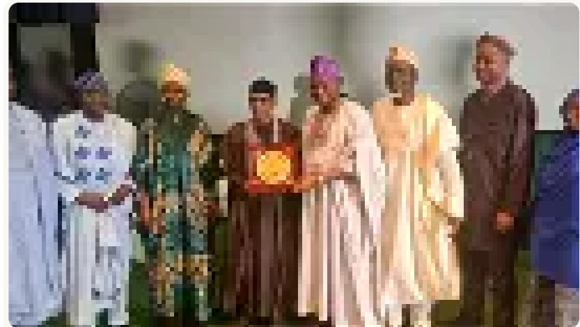
Hardship: It'll be over soon – Shettima tells Nigerians