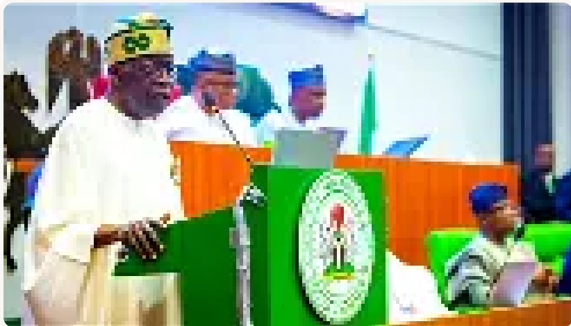
Hajj Reporters urge Tinubu to name other NAHCON Board members