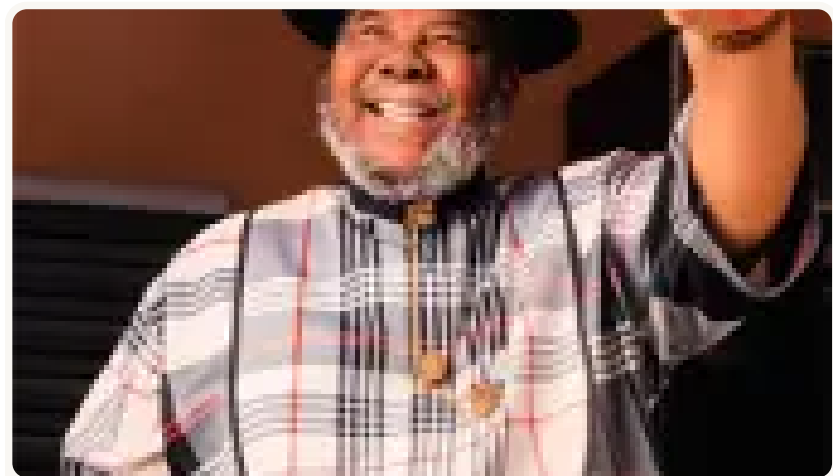
Nollywood stars, fans celebrate veteran actor Pete Edochie at 77