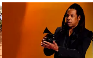
Jay-Z faults Grammys for never awarding Beyoncé Album Of The Year