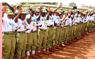
Increase in 'Alawee' uncertain for corps members – Minister