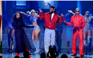
Watch Burna Boy's electrifying performance at the 2024 Grammys Award