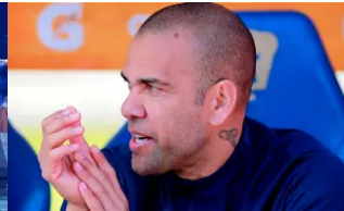
Former star footballer Dani Alves's rape trial begins