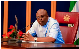
Alleged Terrorism: Court denies bail to Gov Fubara's 5 detained loyalists