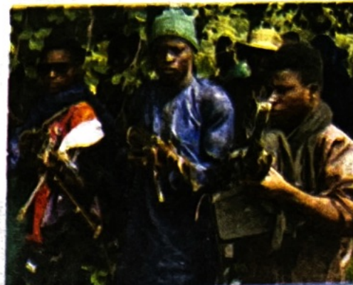
•Criminal bandit gang in Birnin Magaji, Zamfara State. FILE PHOTO