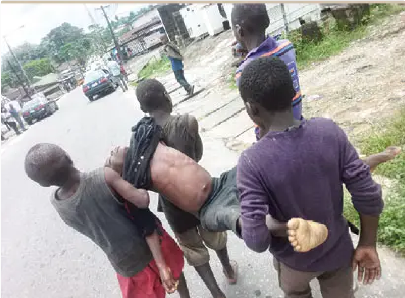
file photo illustratng the incident