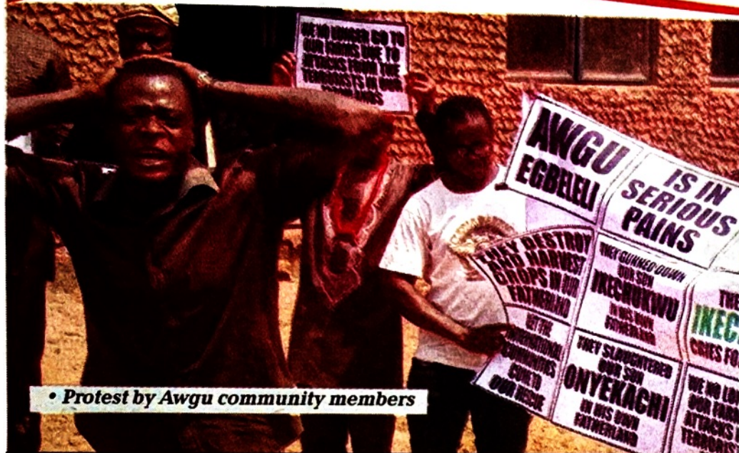
• Protest by Awgu community members