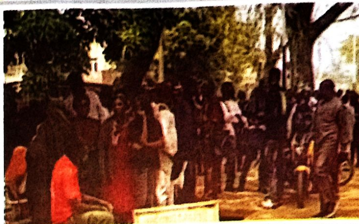
Customers stormed the Central Bank, Kaduna branch to deposit their old naira notes yesterday.