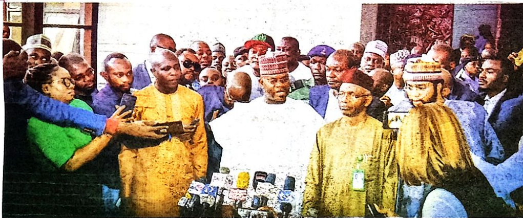
Kogi State governor, Alhaji Yahaya Bello, and his Kaduna State counterpart, Mallam Nasir El-Rufai during the hearing over the CBN currency policy, at the Supreme Court, in Abuja yesterday.