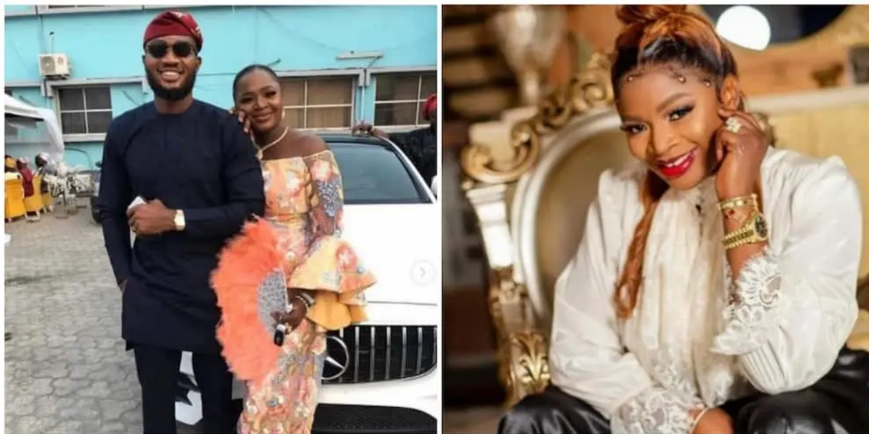
Late Bimbo and husband, IVD