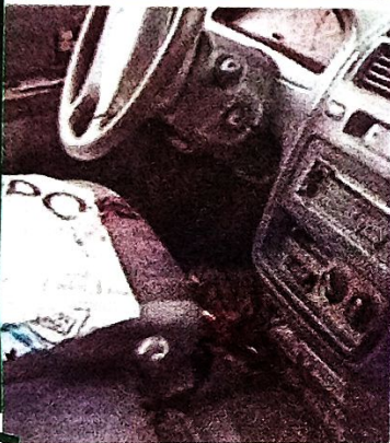
• Wrecked commercial vehicle after gunmen attacked and abducted 8 passengers, leaving the driver dead