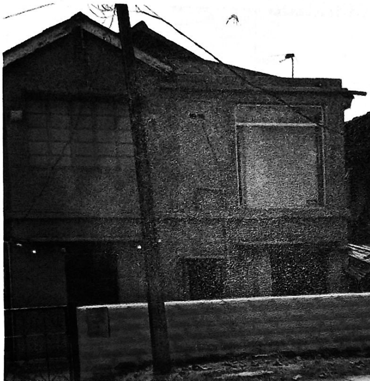
• The house where the incident occurred.

Vanguard further gathered that on Tuesday evening, the late businessman had an altercation with a commercial motorcyclist. The latter was said to have hit the former's vehicle that was parked outside the building. The deceased was said to have insisted on collecting N10,000 from the motorcyclist for repairs of the damage done on his car. Eye witnesses said the okada rider angrily handed him the money, cursing under his breath.