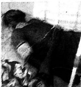
One of those attacked.

"There are about 10 army checkpoints on the road. We waited for sometime before they released my sister. God did it that she was not raped."