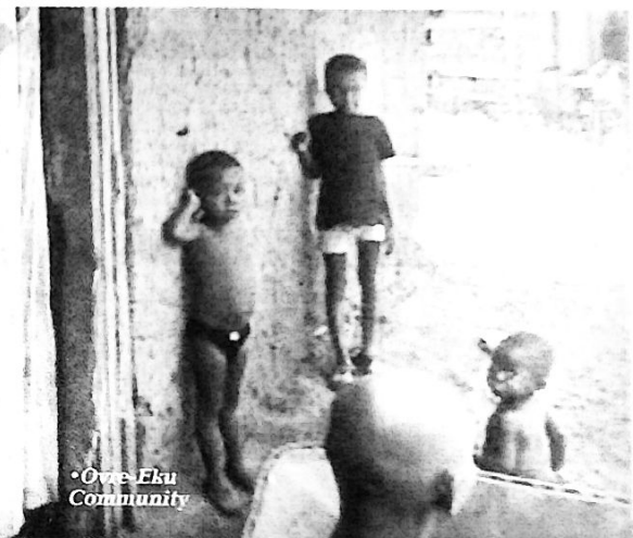
•Ovre Eku Community