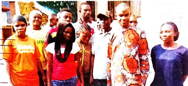
The rescued passengers.

"One of the armed robbers was angry with the other for leaving traces and chose to fire his colleague in the thigh. We knew he was trying to conceal some facts and our men quickly rushed the injured to a