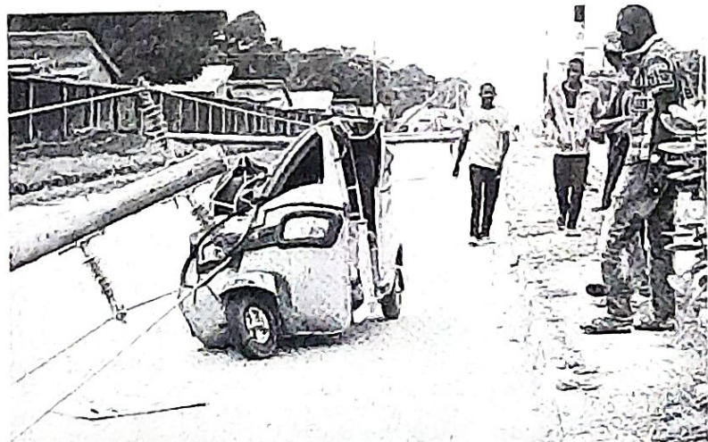
CRASHED: High tension pole fell on Keke NAPEP during a heavy rainfall at Constitution Road, Kaduna, yesterday.

One Toyota Camry, one Toyota Corolla and one Toyota Rave 4, whose owners had been gruesomely murdered were recovered from the gang.