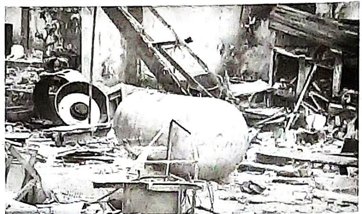
The gas explosion scenes at the opic plaza, Mobolaji Bank Anthony way, Ikeja, caused by gas cylinder vehicle, last night, in Lagos.

vehicle to the inferno said he took to his heels when he noticed the rate at which the fire was moving towards his direction. "I was sleeping in my vehicle."