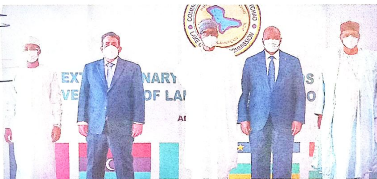
From left, President, Transitional Military Council of the Republic of Chad, Lt.-Gen. Mahamat Idris Deby Itno; Chairman, Presidential Council of Libya Mohammed Al-Menfi; President Muhammadu Buhari; President Faustin-Archange Touadera of Central African Republic and President Mohammed Bazoum of the Republic of Niger during the Extraordinary Summit of the Lake Chad Basin Commission (LCBC) in Abuja, yesterday.