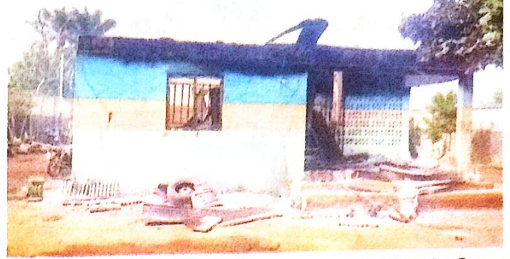
The Police station attacked by unknown gunmen in Iwollo Oghe, Ezeagu Local Government Area of Enugu State.

Also yesterday, there was tension in Enugu as unknown gunmen attacked