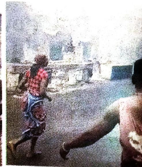
Scene of the tanker explosion.