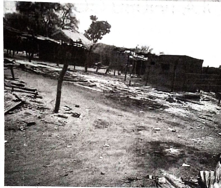
• Structures destroyed by Boko Haram in the Adamawa attack.