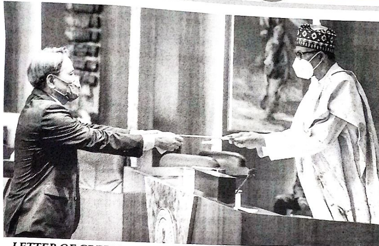
LETTER OF CREDENCE FROM S-KOREAN AMBASSADOR —President Muhammadu Buhari receives Letter of Credence from Amb. Kim Young Chae, Ambassador of South Korea to Nigeria in State House, Abuja, yesterday.