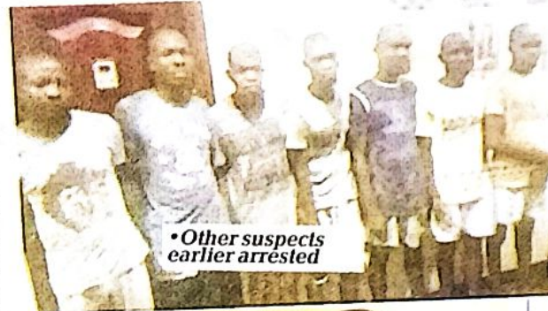
• Other suspects earlier arrested