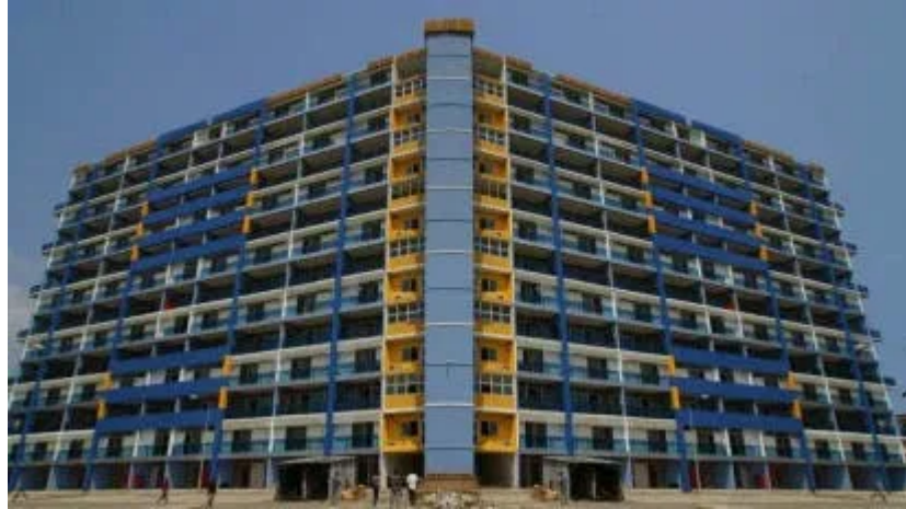
File: 1004 estate in Victoria Island, Lagos

*We were not aware of his presence, action— EFCC