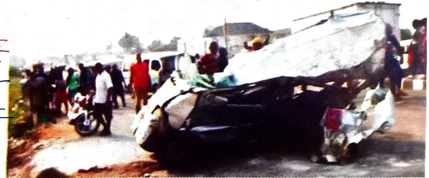
The wreckage of the bus.

Although Vanguard could not immediately ascertain the cause of the crash, an eyewitness said: "The petroleum tanker was conveying diesel to an undisclosed location. You can see two dead bodies from the bus lying on the ground (pointing at them). People are still saying that some other passengers are still under the tanker."