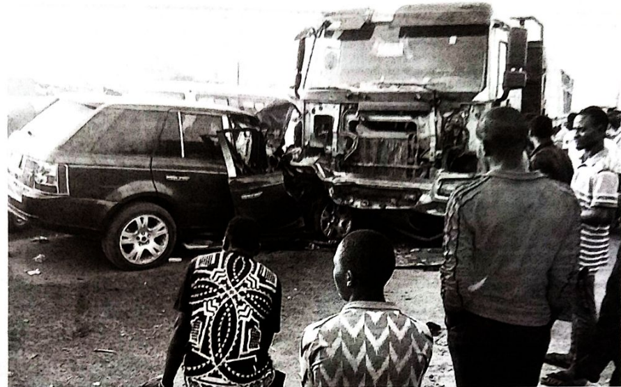
CRASHED: Accident scene where an SUV rammed into stationary truck on Biyanzin Road, near Kubwa Train Station, Sunday night. No life was lost.