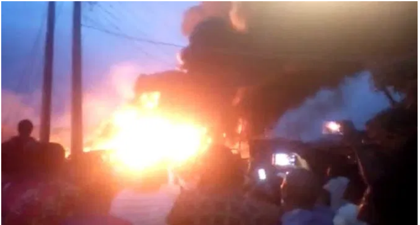
File: Explosion in Lagos

By Olasunkanmi Akoni, Bose Adelaja & Ediri Ejoh