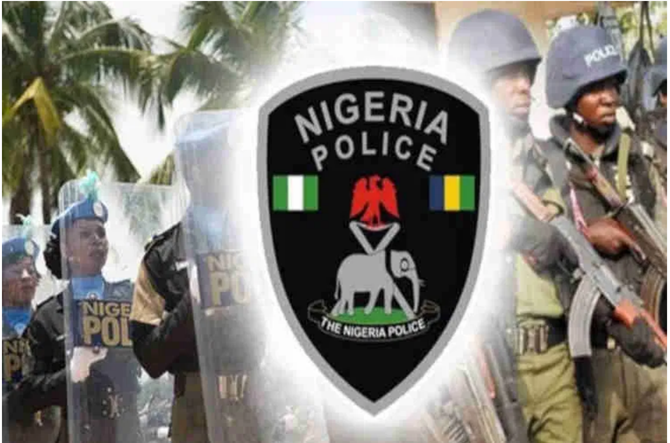
The Nigerian Police

Our men are on ground to forestall further attacks — Police