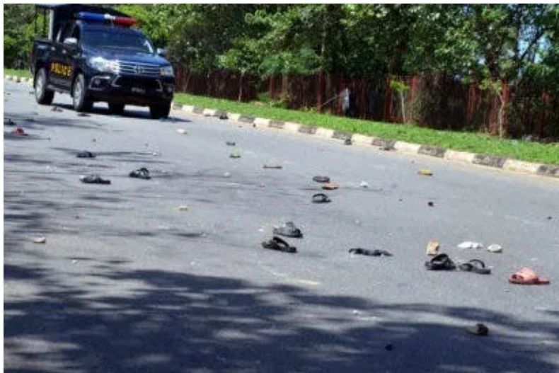
File: Communal Clash