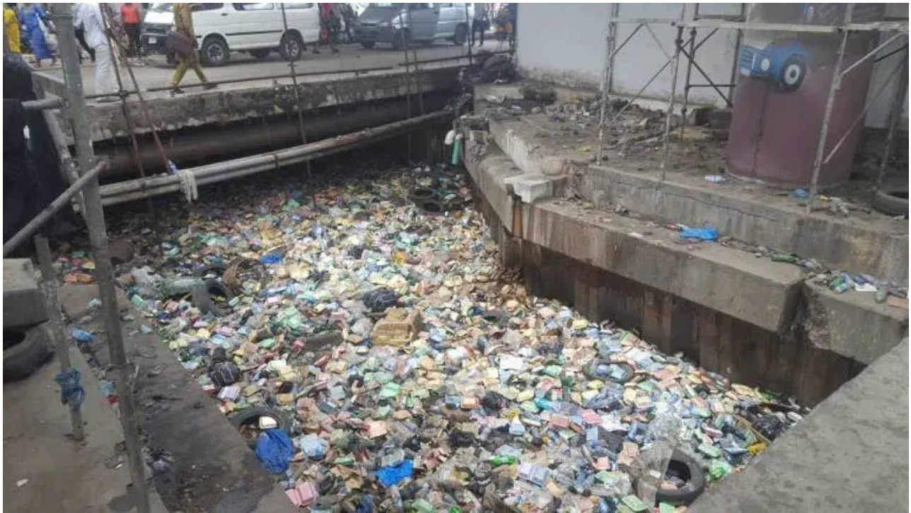
File photo: Canal