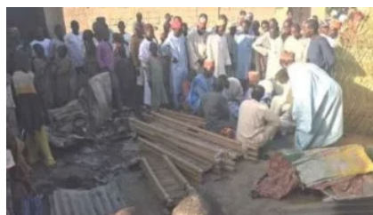
Just in(Photos): Boko Haram attack Borno,