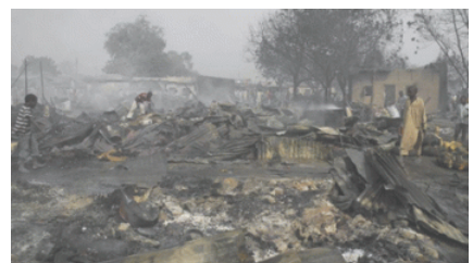
24 Hours after ceasefire: Boko