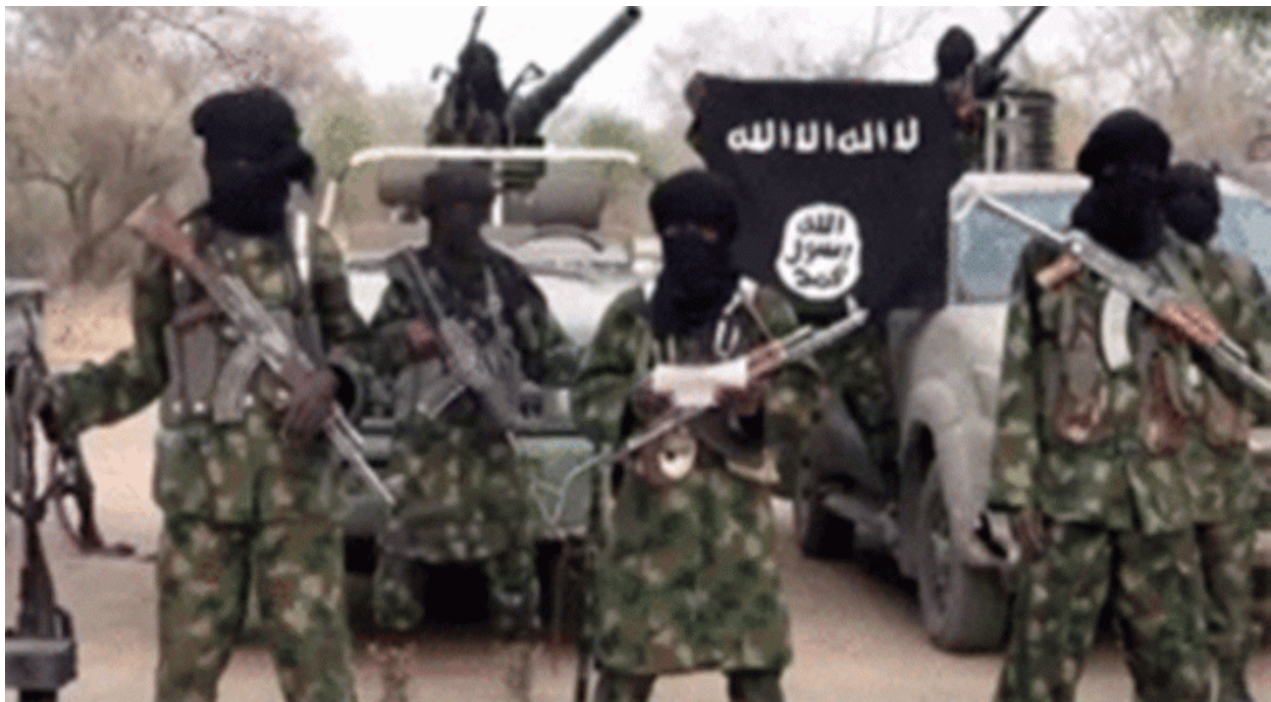
Boko Haram fighters