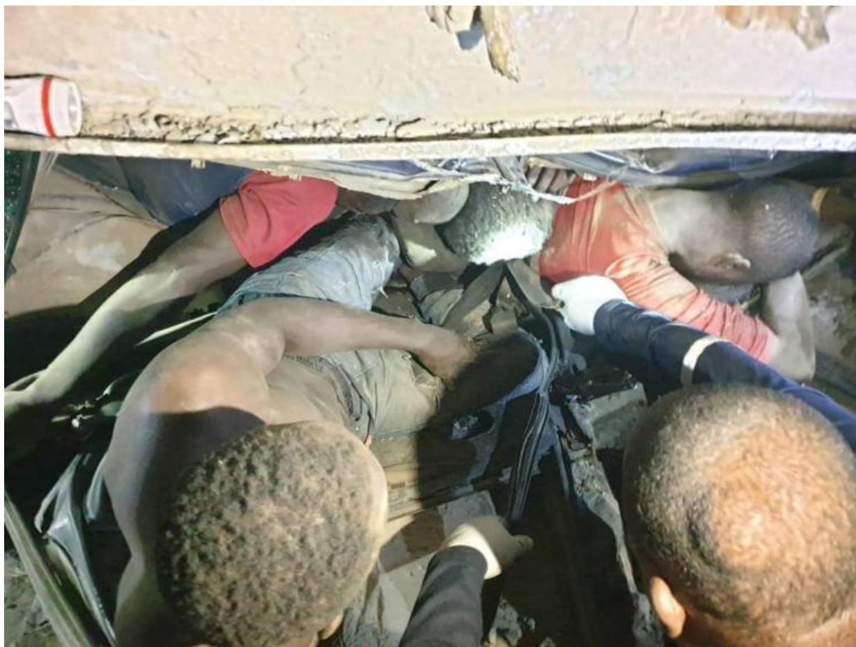
The auto crash victims