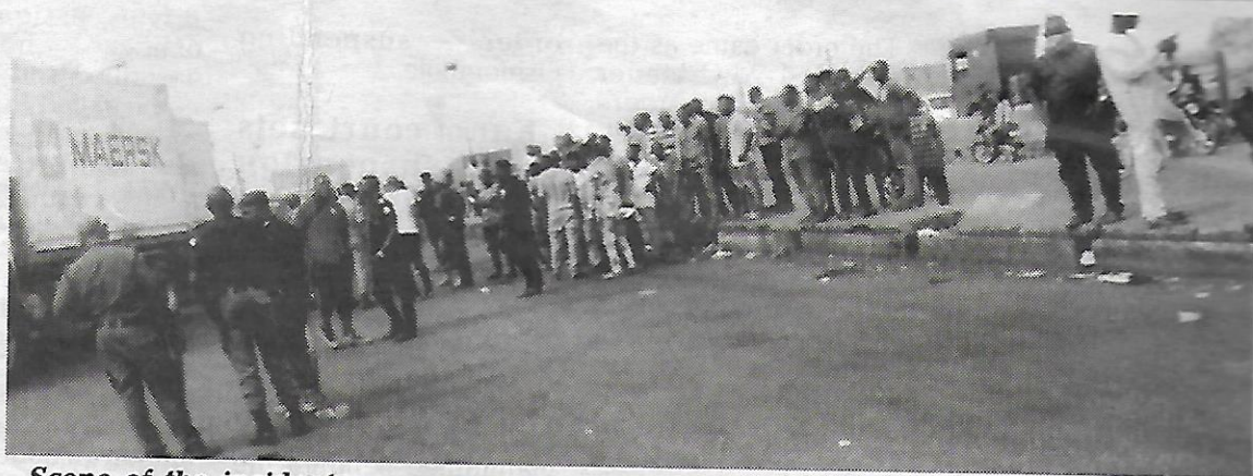
Scene of the incident.

one of them, a female, Miss Funmi Alagunde, pushed back to