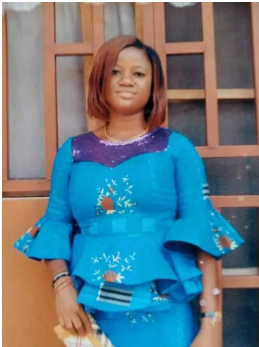
The deceased.