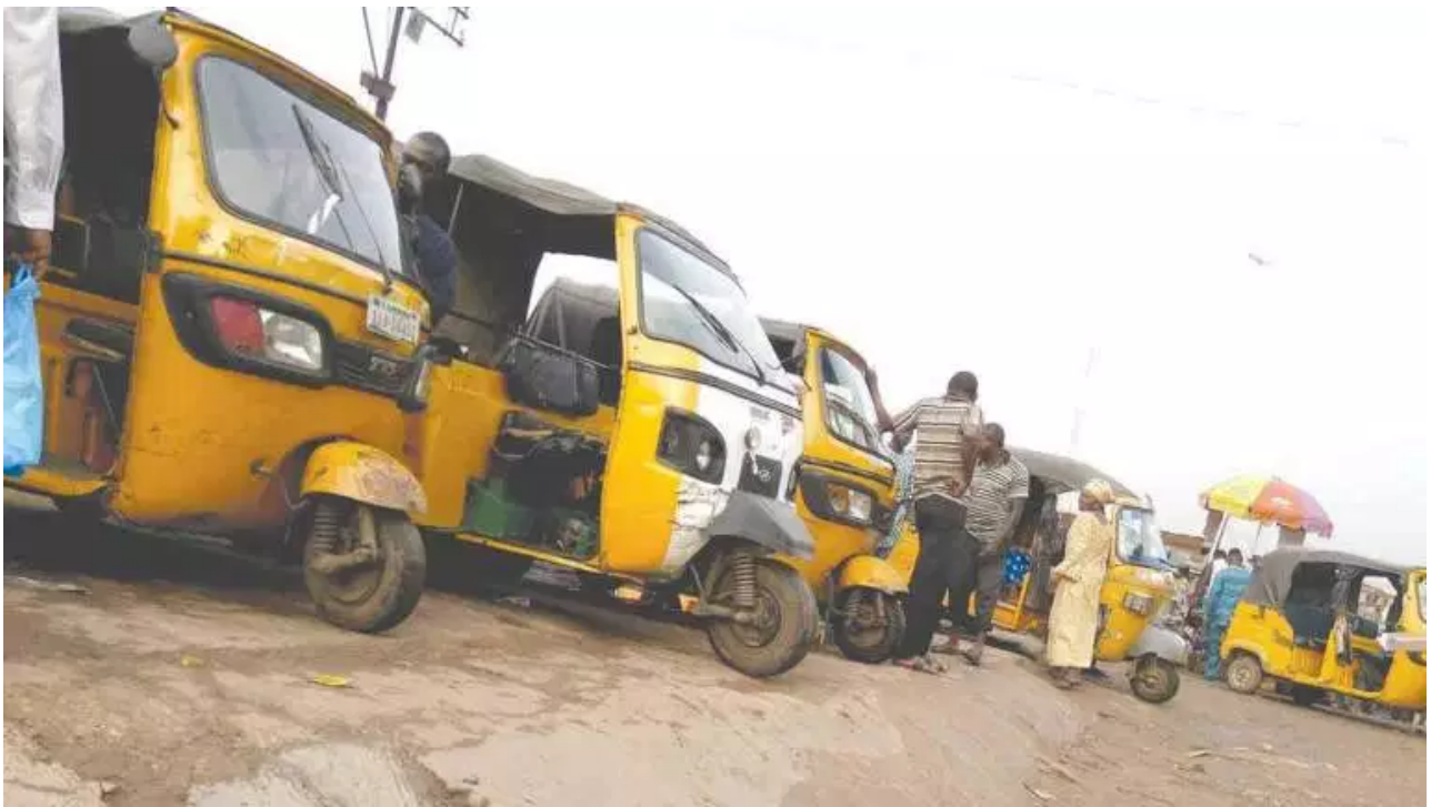
File photo: Tricycle Owners Association of Nigeria (TOAN)