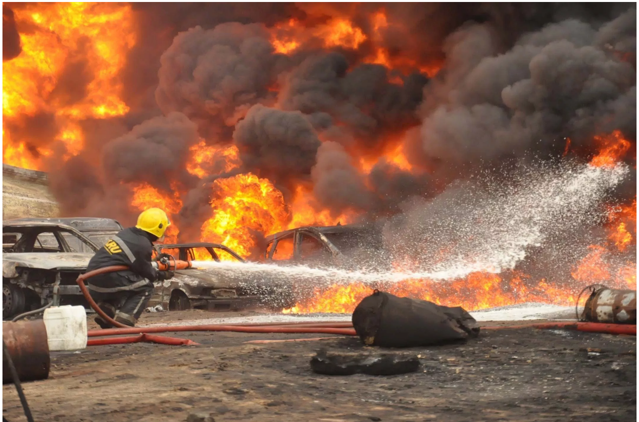
Scene of the fire explosion from the Nigerian National Petroleum Corporation, NNPC pipeline at Ijegun, under Igando-Ikotun Local Council Development Area[LCDA], Alimosho Local Government in Lagos state