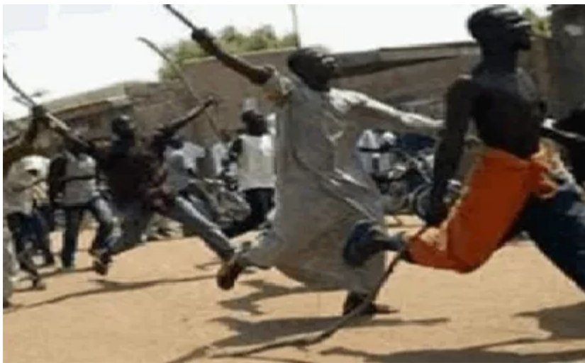
Herdsmen on rampage

Suspected herders reportedly killed two persons, injured three others while many were sent packing from their residences, yesterday, in Iyemero-Ekiti, Ikole Local Government Area of Ekiti State.