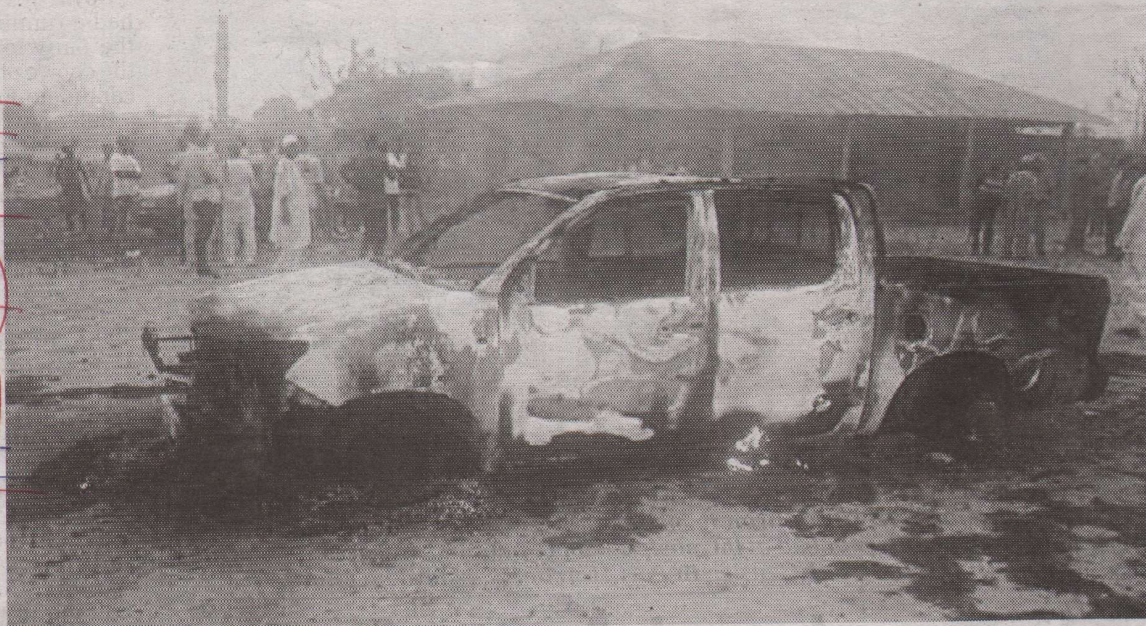
The NDLEA patrol van the killers set ablaze.

Sources within the command said: "The dead bodies of the NDLEA officials were found by some farmers