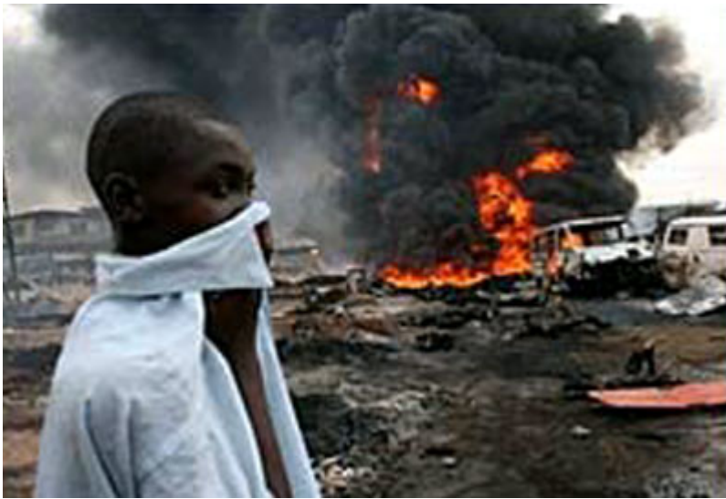
Scene of pipeline explosion

The youths, numbering 2,000, who barricaded the gate of the depot with a coffin containing the corpse of one of the victims, lamented that the pipeline explosion was caused by NNPC's negligence, by pumping fuel through a leaking pipeline which had been abandoned for over three years.