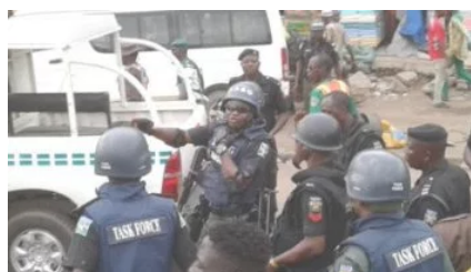
Sales rep caught raping 9-yr-old girl in