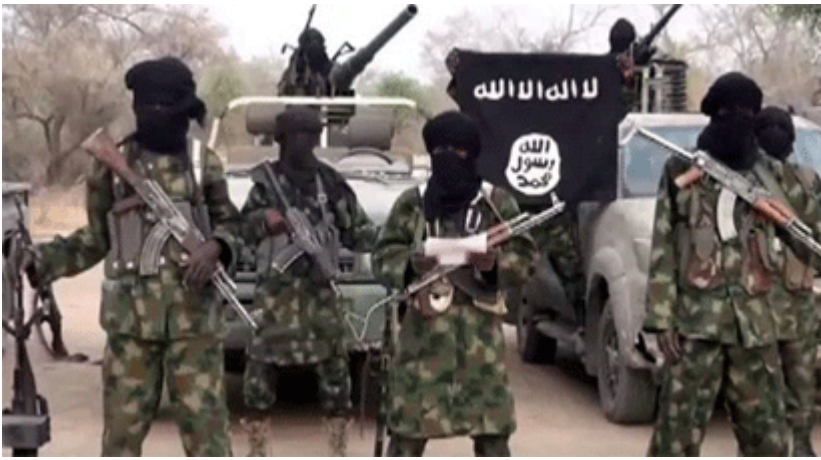
Boko Haram Terrorists

This is even as the Army denied reports that 50 soldiers were lost to Boko Haram insurgents.