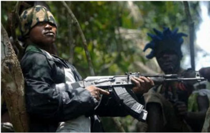
Gunmen hit police station in South Africa, kill 5