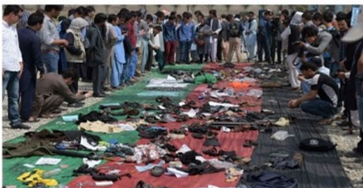
Suicide bomb attack on Kabul Shiite mosque

At least four people were killed in northeast Nigeria on Thursday in a suicide blast at an open-air mosque, militia and refugee camp officials told AFP.