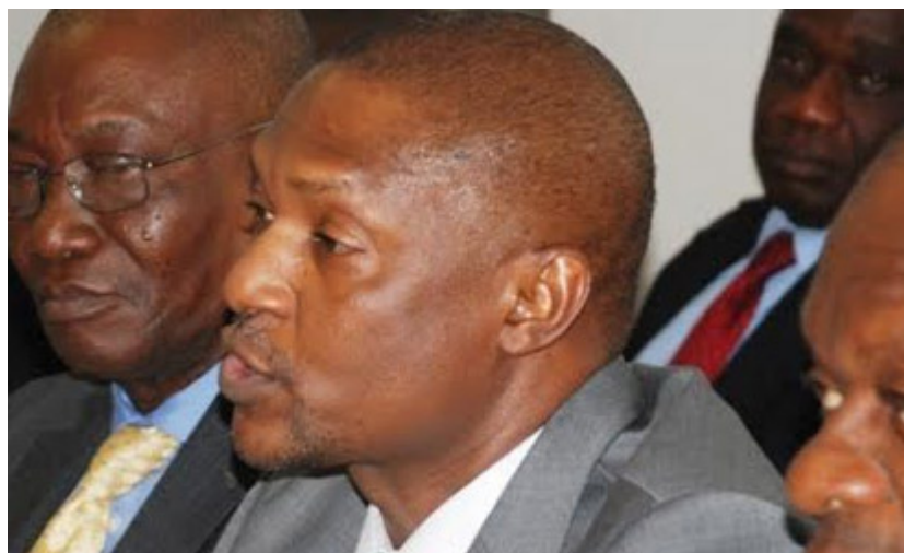
AttorneyGeneral of Federation and Minister of Justice Abubakar Malami