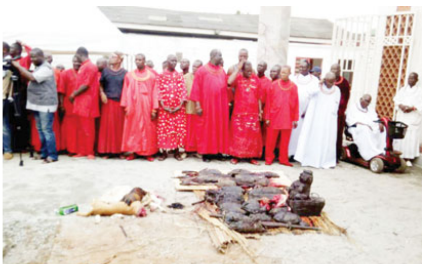
Benin Priests placing curses on human traffickers in Edo

The victim in Italy, (names withheld), was said to be a notorious human trafficker, while the two others were said to be armed robbers, who died in their sleep shortly after returning from a robbery operation.