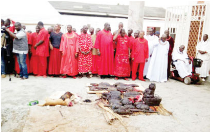
Benin Priests placing curses on human traffickers in Edo

The curses, Vanguard gathered, was necessitated by the disobedience and perversion of native norms by the former officials of the outlawed Community Development Association, CDA, in the village, who flouted the orders of the Benin monarch.