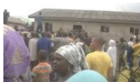
Burial ceremony turns bloody in A-Ibom, as cultist kill one