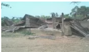
Rising communal clashes, cult wars threaten A'lbom

Meanwhile, the Police have arrested no fewer than 56 suspected cultists, kidnappers and robbers in the last two week, while a notorious kingpin was recently killed in a gun battle with security operatives.