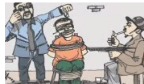
A-Ibom bans parading of kidnap suspects before newsmen