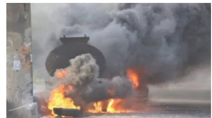
One dead, 5 cars burnt as tanker explodes on East-West Road