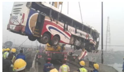
1 dies, 2 injured as vehicle falls into gully in Cross River